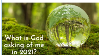
What is God asking of me in 2021?

If your details have changed let the parish office know so that we can update our database for 2021