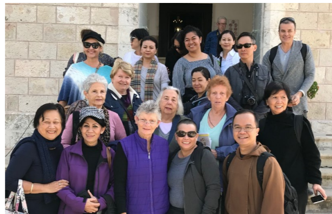
Mass on the sea of Galilee