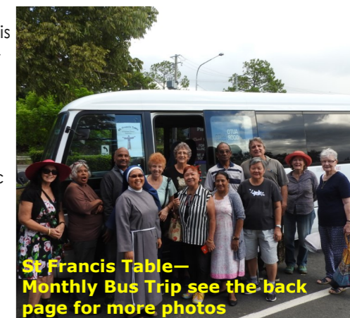
St Francis Table— Monthly Bus Trip see the back page for more photos