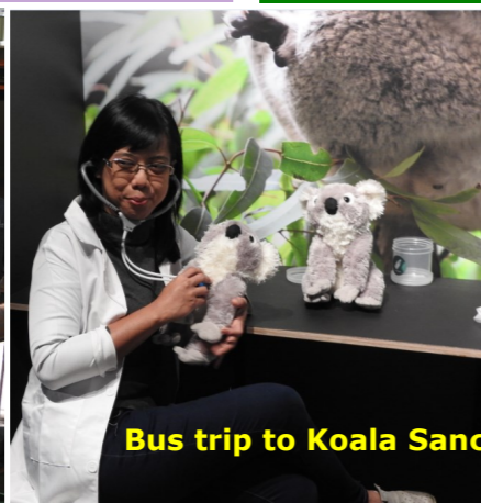
Bus trip to Koala Sanctuary and Yatala Pie Shop