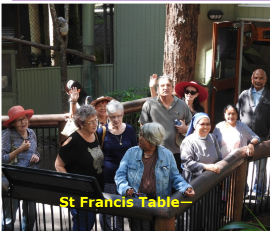
St Francis Table—