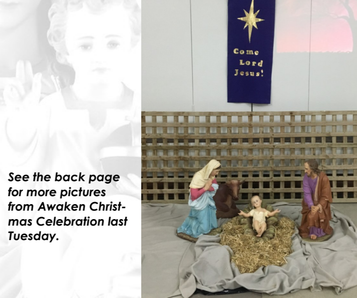
See the back page for more pictures from Awaken Christmas Celebration last Tuesday.