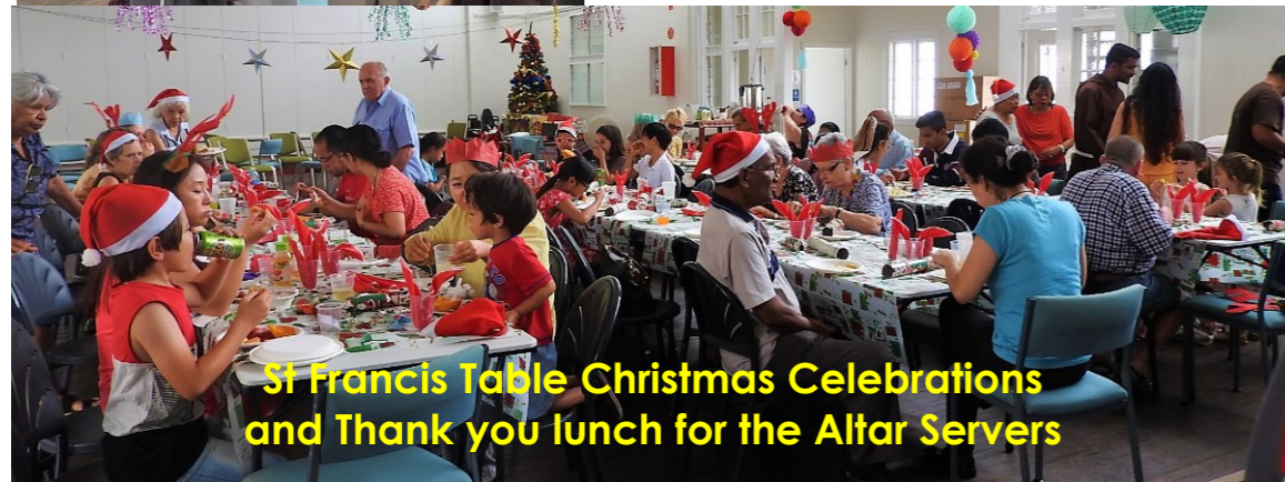
St Francis Table Christmas Celebrations and Thank you lunch for the Altar Servers

Are You Planning a Trip to Sydney in January? Why not stay at Mary MacKillop Place, in the heart of North Sydney! 30 minutes from the Airport, close to Ferries, Trains, Sydney Harbour foreshore, Opera House and more! for Accommodation Enquiries please call 02 89124800