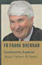
FR FRANK BRENNAN Community Superior Jesuit Fathers Brisbane